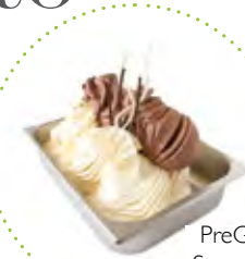
PreGel Gelato, Soft Serve, Frozen Yogurt, or Ice Cream Flavour