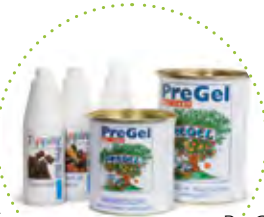
PreGel Arabeschi® or Toppings