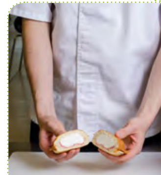
Cut & Serve