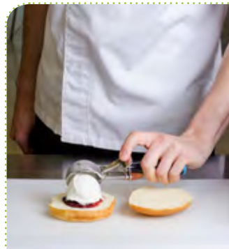
Spread Topping & Scoop Frozen Dessert