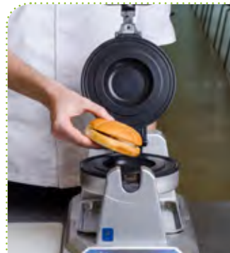
Set in Gelato Panini Press