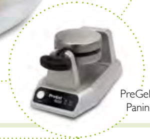
PreGel Gelato Panini Press