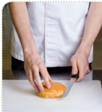
Slice Sweet Bun in Half